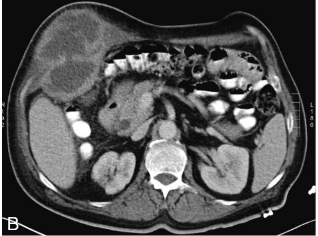
Fig. 2. — Contrast enhanced computed tomography of the upper abdomen.

Because of the multiplanar reconstruction capabilities of modern CT technology, CT scan has become the imaging method of choice for pre-