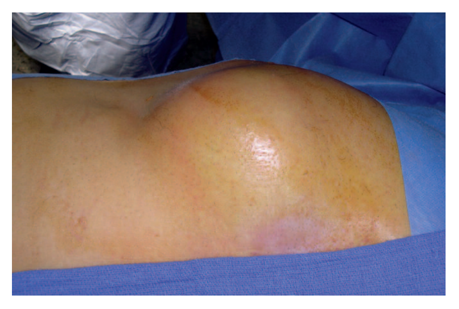
Fig. 1. – Preoperative photograph of the patient revealed a mass in the right subcostal region.

On admission the patient was in a relatively good general condition, with a heart rate of 100 beats/min and a systolic blood pressure of 140 mmHg. He was afebrile and anicteric. The white blood cell count was 15.900/mm3 (4-8) with 77% segments and we noted a CRP of 10.1 mg/dl (< 0.5). Gamma-glutamyl-