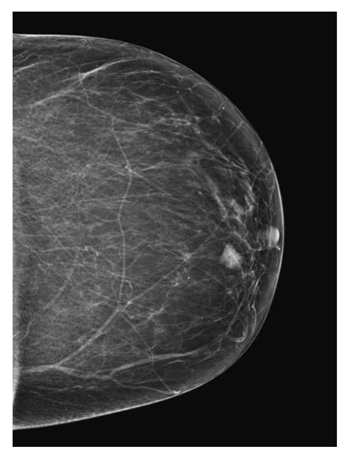
Fig. 3. — Craniocaudal mammogram of the left breast determines retroareolar localized microlobulated mass.