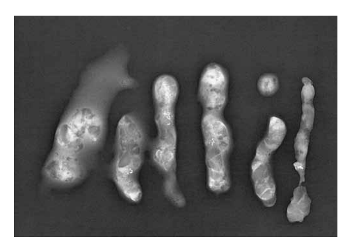
Fig. 2. — Mammogram of the specimen obtained by stereotactic vacuum-assisted biopsy shows microcalcifications.

localized microlobulated mass (BIRADS category IV) measuring 15 \times 12 mm (Fig. 3). Ultrasound examination confirmed a hypoechoic mass in the same location