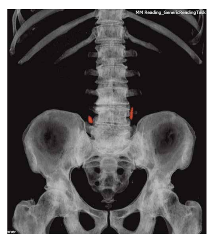
Fig. 2. - 3D «bone» reconstruction with the red coloured bilateral mid ureteral stone.