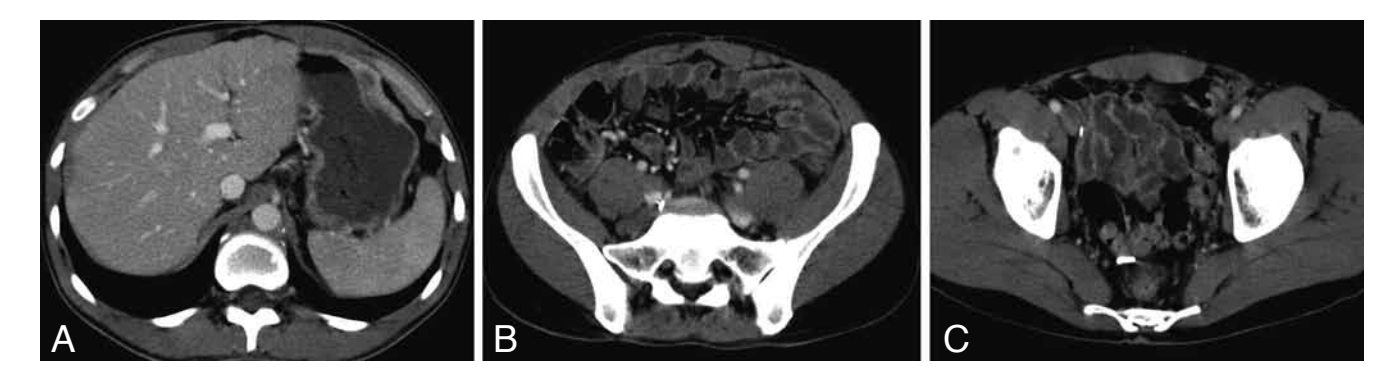
Fig. 1. - 22-year-old man with prior history of testicular cancer. Intravenous contrast-enhanced transverse CT scans of the abdomen and pelvis after oral administration of neutral barium sulphate suspension. Both readers graded the stomach (A) wall visualization and distention as 3.0. Jejunal (B) wall visualization was graded as 2.5, and distention as 2.5 and 2.0. Ileal (C) wall visualization was graded as 2.5, and distention as 2.5 and 2.0.