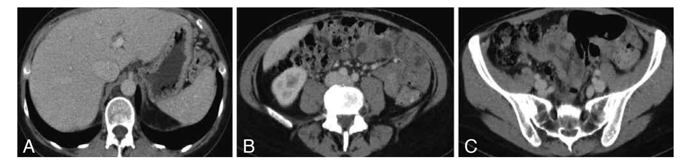
Fig. 3. – 48-year-old woman for follow-up of suspected splenic lesion. Intravenous contrast-enhanced transverse CT scans of the abdomen and pelvis after oral administration of water. Both readers graded the stomach (A) wall visualization and distention as 2.0 and 1.5. Jejunal (B) wall visualization was graded as 2.0 and 1.5, and distention as 1.5. Ileal (C) wall visualization and distention were graded as 1.0.

regarding patients' gender and race, mean age, weight, and height. Using ANOVA, mean time interval between the MDCT scan and the start of ingestion of neutral barium sulphate (81 min), positive barium sulphate (91 min), and water (84 min) were not significantly different. None of the patients reported adverse reaction to the oral contrast media administered.