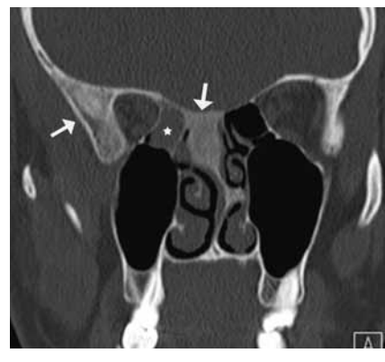
Fig. 3. — Coronally reconstructed multiplanar CT image (bone algorithm). Note the typical ground glass appearance and expansion of the lateral orbital wall and nasal septum (arrows). Anterior part of mucocoele is seen medial to the medial orbital wall (asterisk).

Preoperatively the diagnosis of a sphenoid mucocoele as a complication of fibrous dysplasia of the facial bones was made. The patient was sheduled for transnasal sphenoidotomy. The anterior and inferior wall of the sphenoid sinus were removed allowing drainage of the mucocoele. Preoperative diagnosis was confirmed surgically. Pathological find-