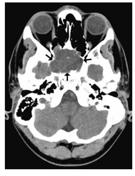
Fig. 1. — Note slightly hypodense mass (arrows) involving the sphenoid sinus area on this transverse non contrast enhanced CT image (soft tissue algorithm).

A 28-year-old man presented to the emergency department with a history of severe occipital headache for two days. He had self medicated with over the counter analgetics but this had been unsuccessful in alleviating the pain. He also reported pain in the neck region irradiating to the right shoulder and hand and tingling in the hand. On further questioning he reported daily headaches for years in addition to a stuffed nose. On physical examination his head was lateroflexed to the right. Paresthesia of the right arm was present but otherwise neurological examination was unremarkable. The results of laboratory tests were normal.