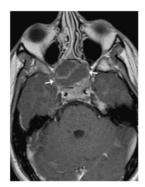
Fig. 4. — Transverse T1-weighted MR image after contrast administration. Note isointense sphenoid sinus mass with rim enhancement (arrows).

ings of the bone fragments confirmed fibrous dysplasia. Postoperative evolution was unremarkable.