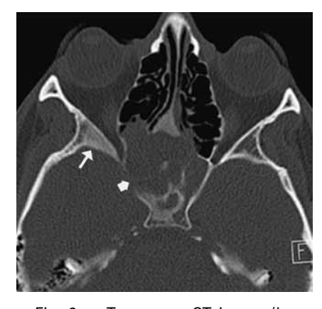
Fig. 2. — Transverse CT image (bone algorithm) shows eroded medial wall of the expanded sphenoid sinus (short arrow). Note ground glass appearance in expanded bone (long arrow) typical of fibrous dysplasia of the skull base.

On the basis of these findings a non-contrast enhanced CT of the skull with multiplanar reconstructions was performed. CT revealed a large slightly hypodense and expansile mass in the sphenoid region (Fig. 1). Erosion of the bony walls of the sphenoid sinus was also present. Findings characteristic of fibrous dysplasia were also depicted in the facial bones and included a ground glass appearance and expansion of the bony structures (Fig. 2, 3). Subsequently an MRI of the skull was performed. On T1-weighted images with intravenous contrast the expansile lesion of the sphenoid sinus appeared hypointense and showed delicate rim enhancement after intravenous contrast administration (Fig. 4). On T2-weighted images the mass appeared hyperintense (Fig. 5).