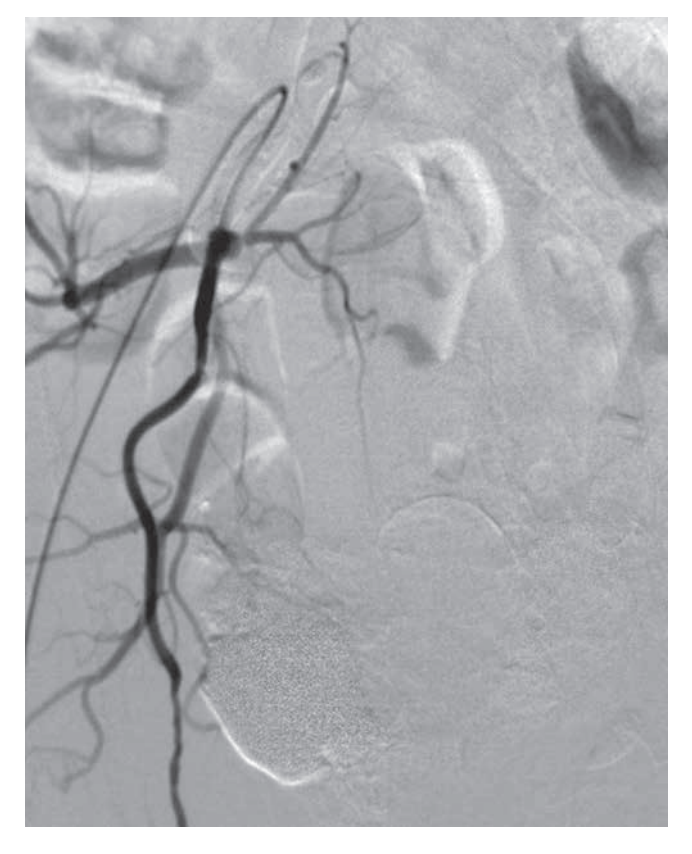
Fig. 3. — Following embolization, selective angiography demonstrates that flow to the previously identified area of neovascularisation has been ceased.

nature of radiologically guided embolization, combined with its efficacy, therefore make it an attractive therapeutic option in these patients.