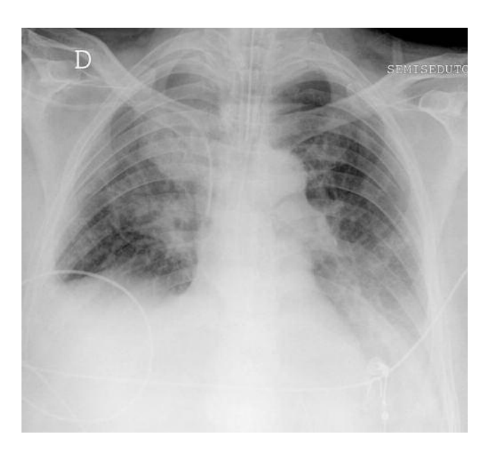
Fig. 1. — Anteroposterior portable chest radiograph obtained on postoperative day 8 shows opacification of the right paratracheal zone. Note also a pleural fluid collection in the left lower lung zone.

A 57-year-old man with a medical history of myotonic dystrophy type 1 (Steinert disease) underwent right upper lobectomy and systematic lymphadenectomy for a 20-mm well differentiated neuroendocrine carcinoma with lobar and interlobar lymph nodes involvement, staged as a T1N1 tumor. Multiple firings (n = 4)of a gastrointestinal anastomosis stapler with a 55 mm 3.85 mm load of titanium staples were used to complete both minor and major fissures. The surgical procedure was straightforward: no safety-compromising events known to be associated with a risk of retention of a foreign body occurred (3, 4) and repeated counting procedures of instruments and surgical sponges were correct. On postoperative day 2, hemodynamic compromise and acute respiratory failure developed following aspiration of gastric contents. The patient underwent endotracheal intubation and mechanical ventilation. Anteroposterior portable chest radiographs demonstrated opacification