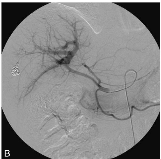
Fig. 2. – A: Follow-up MDCT on day 17 revealing a wedge-shaped early transient segmental parenchymal enhancement at the posterior part of the right liver lobe due to a rather large arterioportal shunt between a branch of the right hepatic artery and the posterior branch of the right portal vein. B-C: Selective angiography demonstrating the arterioportal fistula (APF) in the right liver lobe (B) and a post-procedure image (C) after successful embolization of the APF and HAP.

contrast-enhanced CT as a round, focal lesion with high attenuation that is almost identical to major arterial structures. Selective angiography was the gold standard for diagnosing HAP. Tobben et al. (5) reported a sensitivity for HAPs of 100%, 67% and 33% by SA, CT and duplex sonography. The sensitivity of the newer generation US and MDCT is higher so that these non-invasive techniques are today the first choice if HAP is suspected. SA may also reveal active bleeding and/or anatomic variants. Treatment of choice is hepatic artery embolization, which has a high success rate and can be performed immediately after diagnostic arteriography (6). The embolization should be as selective as possible in order to decrease the risk of ischemia and the risk of collateral/retrograde flow from branches distal to the point of embolization.