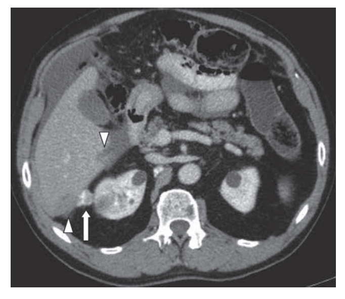
Fig. 1. — CT scan of the upper abdomen, after iodine contrast injection, showing perihepatic ascitis and hyperattenuating nodules in the Morison pouch (arrowheads), one of these being calcified (arrow).

Some CT findings are suggestive of peritoneal carcinomatosis including the presence or ascites (a non specific finding), nodules in the fatty tissue of the peritoneal cavity (omentum, mesenteric roots, Douglas pouch), and nodules adjacent to the liver edge (8, 9). CT scan can help to