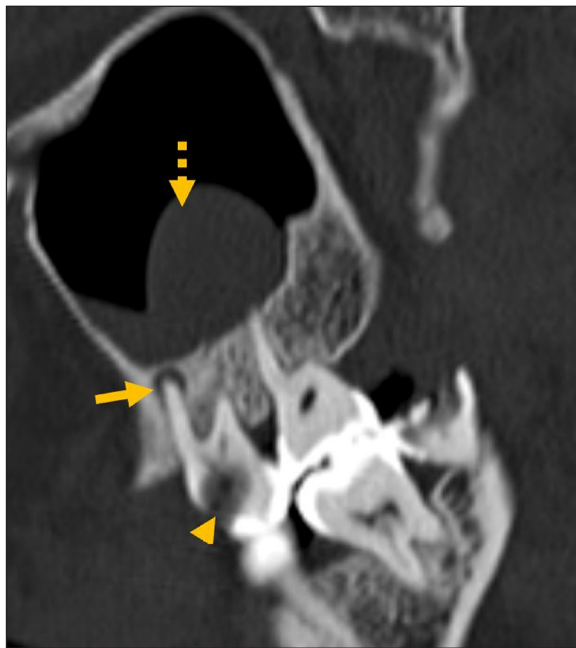
Figure 1 Dental caries (arrowhead) and periapical lucency (arrow) in the same tooth with adjacent polypoidal mucosal thickening (dashed arrow).

immediately adjacent to the diseased tooth or presence of an obvious erosion in the floor of the maxillary sinus adjacent to a diseased tooth (Figures 2 and 3).